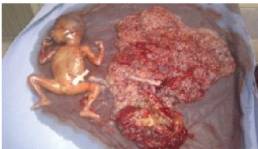
Figure 2a: Morphologically normal fetus (A) and a normal placenta (P) next to a placenta with a molar appearance (M).