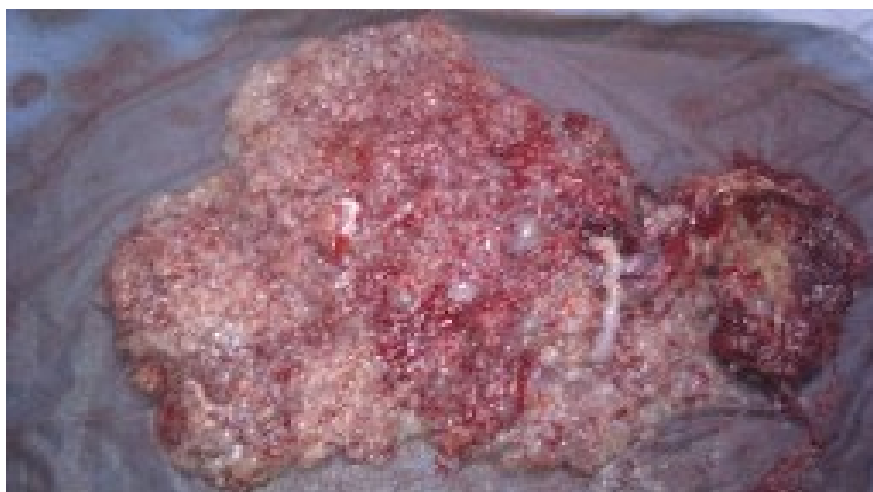
Figure 2b: Delivery product: Coexistence of a normal placenta (P) with a large vesicular placenta in molar transformation (M).