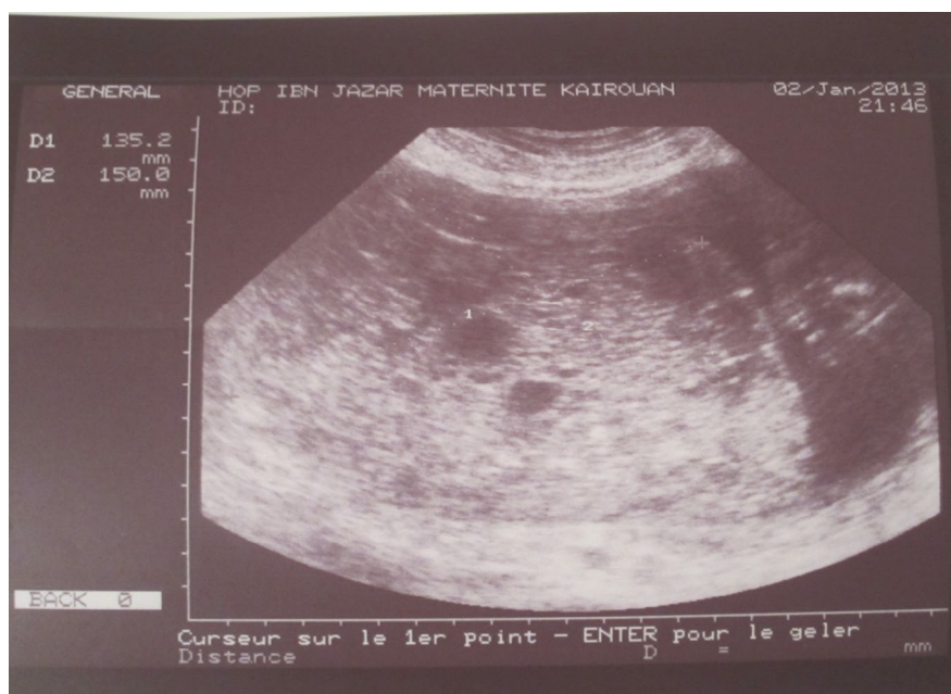
Figure 1: Ultrasound aspect of a hydatidiform mole associated with a normal fetus.