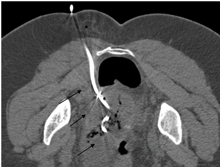
Figure 2: Axial Image of a computed Tomography that demonstrates a 12 F drainage catheter inserted via right transgluteal approach (Black arrows) into the pelvic abscess collection.

paralytic ileus and managed with naso gastric tube, I.V fluids and potassium replacement. Even though she was passing flatus and had scanty bowel movement; her abdominal distension, nausea and vomiting was increasing. She also developed low grade fever with mild elevation of C-Reactive protein and White cell count. Urine culture and blood culture were negative.